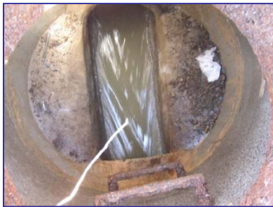
Flow measurements are taken throughout the collection system to determine the correct pump station upgrade size.

This project includes the upsizing of force main and gravity mains in an area South of I-10 between Blue-bonnet Blvd and Siegen Lane. The upgrades are designed to alleviate chronic SSOs at the pump stations and increase sewer capacity.